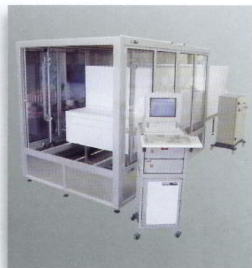
Cutting Machine photo supplied by Croma.