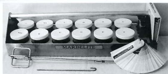
Marbelite Tint Kit